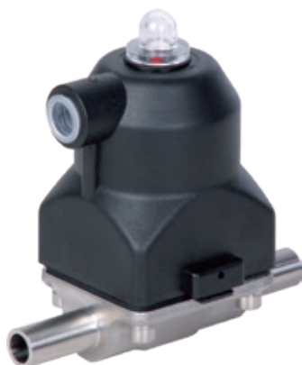
HS-Version, Cf. 4 & 5