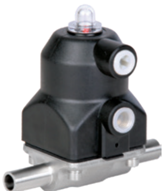
HS-Version, Cf. 1, 2 & 3