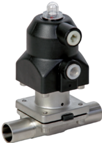
Cf. 1, 2 & 3