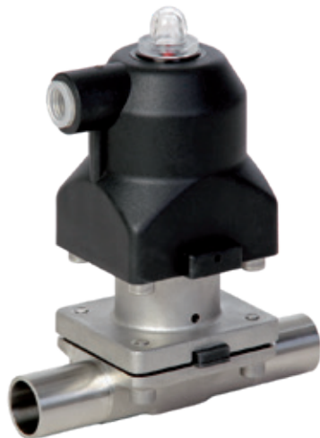
Cf. 4 & 5